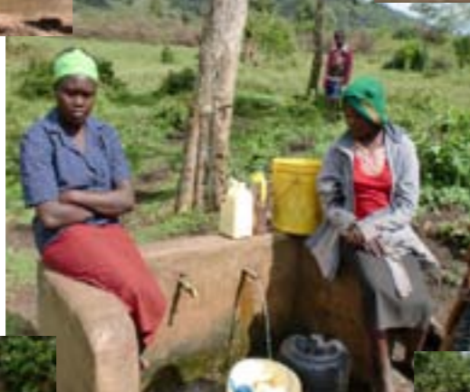
Fetching water has never been easier.