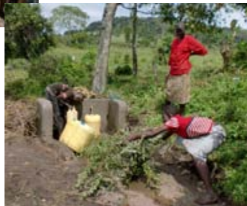
Women from the community fetching water from the tap after the pipe repairs.