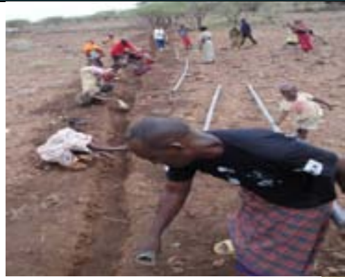
Logologo Women group working together to build water pipes for their farm