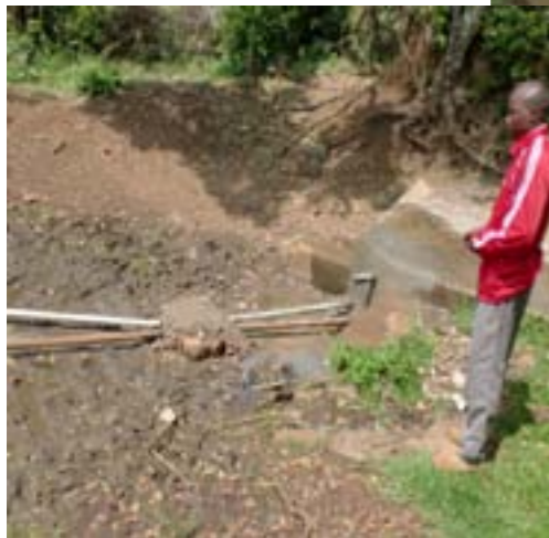
IIN-MADRE repair water source piping