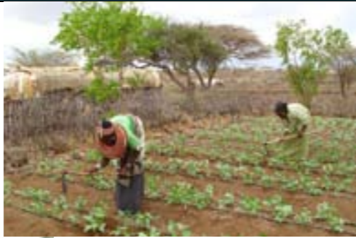
Merigowomen in their farm with irrigation water pipes installed. The pipes water their plants from a nearby water source.