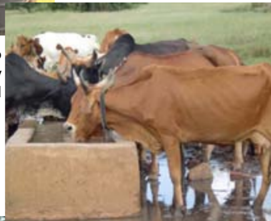
A cattle water trough built through a partnership by IIN and MADRE. Ensuring livestock have water throughout the year.