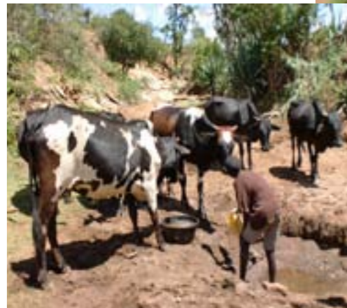
A herd boy fetching water for his cows from a water hole that is dying up and barely able to meet the needs of the community and their livestock