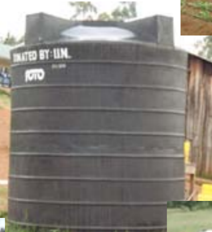
IIN donates water tanks to Kilgoris girls schools so that they are able to trap rain water and use it in school.